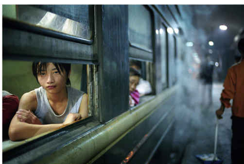
# 7024-9_kb Shortly before departure. One young man has struck it lucky: he's sitting by one of the few windows that are not broken and so can be opened. Guangzhou, Guangdong Province. February 2005

Image size: 34x51cm Paper size: 50x60cm Edition: open