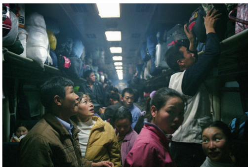
# 7023-27_kb The vast majority of migrant rural workers going home are packing China's trains in journeys that can easily last two days. Guangzhou, Guangdong Province. February 2005

Image size: 34x51cm Paper size: 50x60cm Edition: open