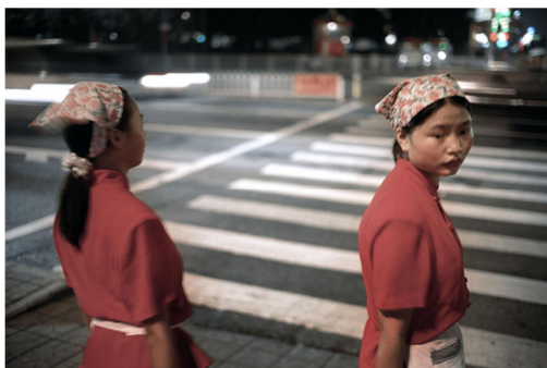
# 5748-31_kb Two migrant rural workers at night in the "special economic zone" of Shenzhen. Shenzhen, Guangdong Province. September 2002

Image size: 34x51cm Paper size: 50x60cm Edition: open